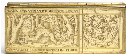
Writing Box, Gilt brass, Germany, ca. 1550, depicting a wild man and scenes of chaos, Mus. No. M.2823-1931

Brass is a versatile metal. It is both a working metal and a decorative one. Its use in horology reflects its qualities as a soft metal ideal for engraving dials on precision instruments. Candlesticks cast in moulds and basins beaten into form from sheet represent an industrial metal marketed for a range of mass-produced items. Exquisitely chased tobacco boxes and bowls reveal brass as an 'art' metal.