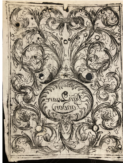
Philip Thornton archive, ref. THO/01/062. Tracing from the repair file for a clock signed Quare, London, repaired for Mr Ilbert (January 1937).

Draisey's notebooks, apparently written – in perfect calligraphic script and hand-illustrated throughout – when he was training as a clockmaker in the early twentieth century. Finally, Dorota will talk about what it takes to create a well-curated, easily accessible and physically cared for archive, to ensure its long-term preservation for the enjoyment of all. She will also highlight some conservation nightmares, where incorrect storage of documents in various formats can result in an irretrievable loss of valuable information.