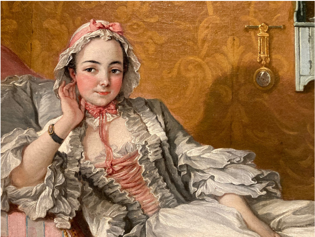
Detail, A Lady on Her Day Bed , 1743, François Boucher, watch and chatelaine on wall.