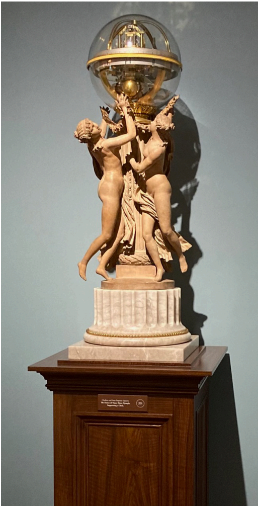
The Dance of Time: Three Nymphs Supporting a Clock , 1778, quarter-striking movement by Lepaute, Clodion sculptor. One of few surviving eighteenth-century French clocks with terracotta sculpture.

with a few other examples, Edey noted the mainspring maker – Monginot. There is a 1653 table clock by David Weber with astronomical and calendrical dials, and a 1650 gilt-brass table clock by Pierre de Fobis that has one of the earliest surviving examples of a spring-driven movement. A ‘ Tête de Poupée ’ clock, c. 1680–90, is by Balthazar Martinot II. An 1811 Breguet carriage clock, one of the earliest examples, has lunar, calendar, alarm, and quarter-repeat complications.