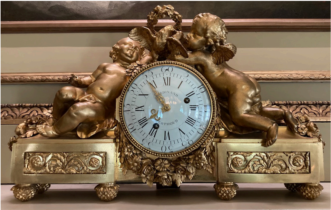
Gilt-bronze mantel clock c. 1770, dial signed 'Ferdinand Berthoud'.

undiscovered information, assembled over decades by that dedicated and meticulous scholar and collector, that merits our attention.