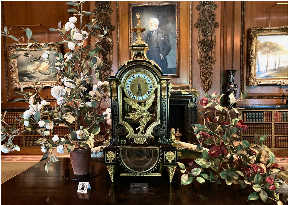
Barometer clock, c.1690–1700, case by André-Charles Boulle, movement by Isaac or Jacques Thuret, in the mansion's library. In the background is a portrait of Henry Clay Frick by John C. Johansen (1876–1964).