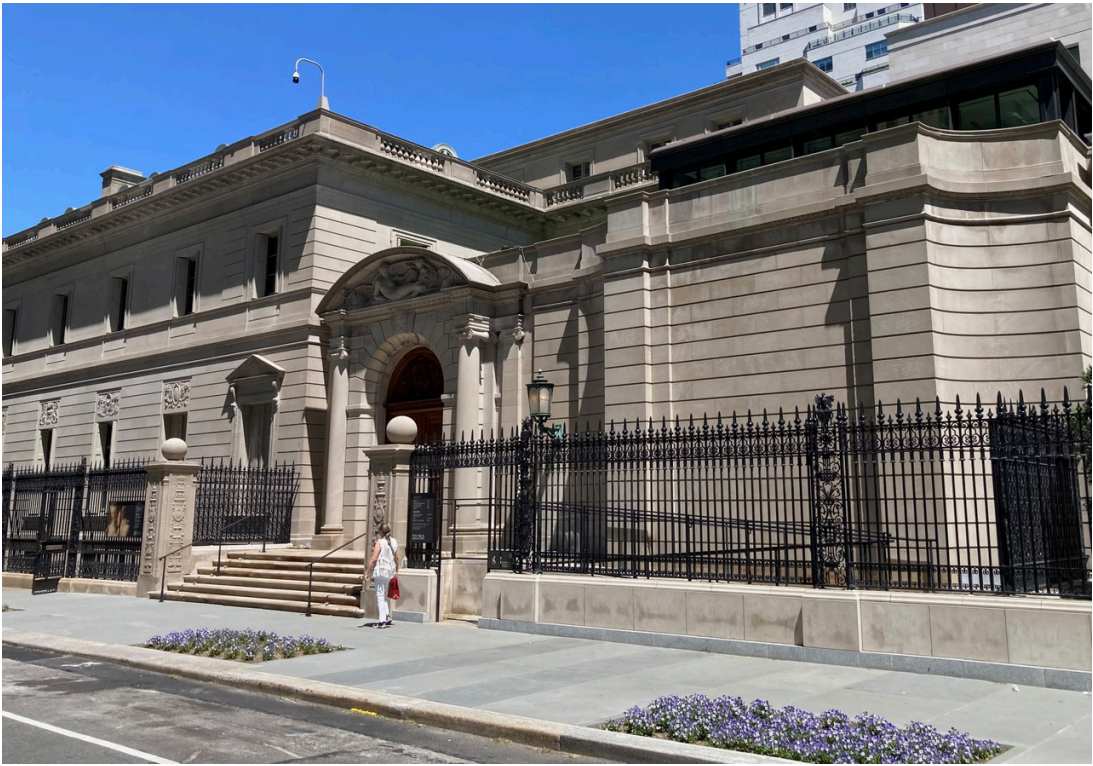
Entrance to the Frick Collection, 10 East 71st Street, New York City.