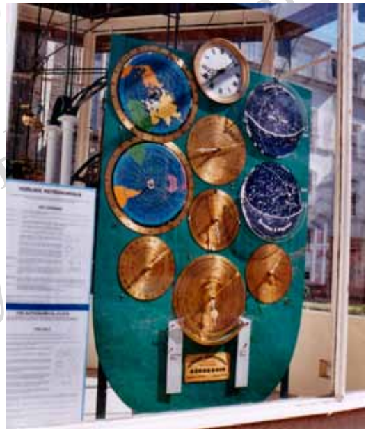
Fig. 5. View of the dials.

time zone (Greenwich). Standard time (in France) is advanced sometimes by an hour, sometimes by as much as two hours. The dial has the traditional hour, minute and second hands.