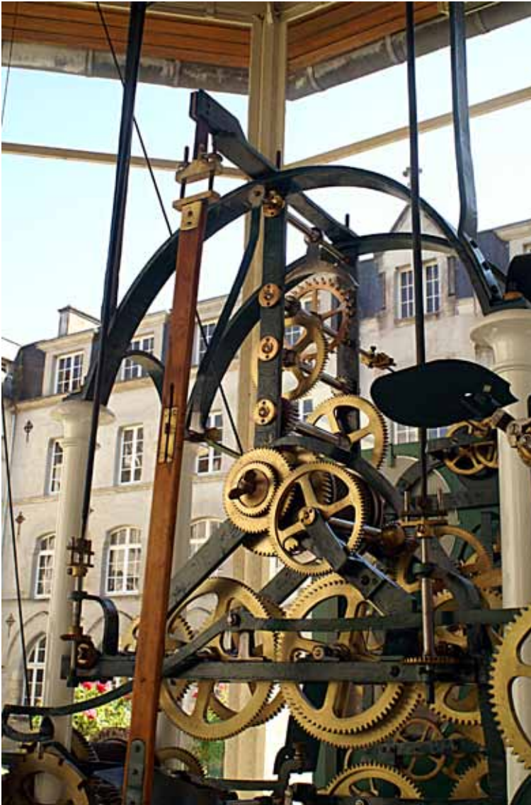
Fig. 3. The movement, with the vertical rods connected to the planetary system and two of the cables connected to the bells that are suspended from the ceiling.

store for books, clothing, etc. Brother Bernardin dismantled the clock and packed it into cases. It was not put together again in his lifetime.