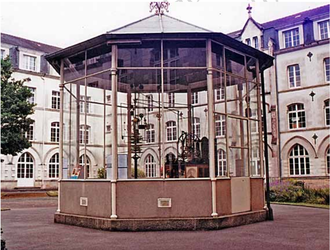
Fig. 1. The kiosk containing the astronomical clock.

a building. Following this sign we came to a nondescript opening through another building. Proceeding through this opening we came into a delightful courtyard, full of flowers, trees and shrubs, in the centre of which was a large glazed kiosk (Fig.1). The kiosk contained a large magnificent astronomical clock and orrery belonging to the Community of Brothers of Ploërmel. We learned later that this clock was classified as a historic monument in 1982 by the French Minister of Culture. The design and workmanship of this clock is excellent and it is surprising that it appears not to be known about in the UK. The intention of this article is to make good this omission.