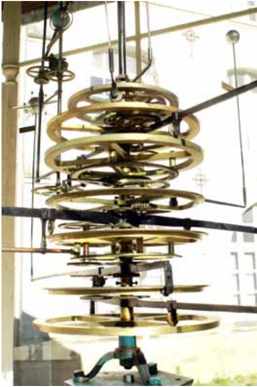
Fig. 16. The gearwork of the planetary system.

white hand indicates the years; it rotates once every century. The small black hand indicates the centuries; it rotates once every 1000 years!