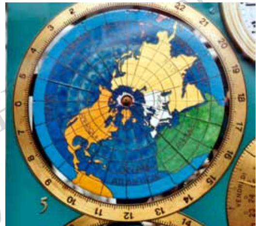
Figs. 6-9: The dials nrs. 2, 3, 4 and 5.

Dial No 2 serves as a calendar. The short white hand indicates the date, and the long yellow hand, the day of the week. For 30 day months the white hand has to be moved forward by hand.