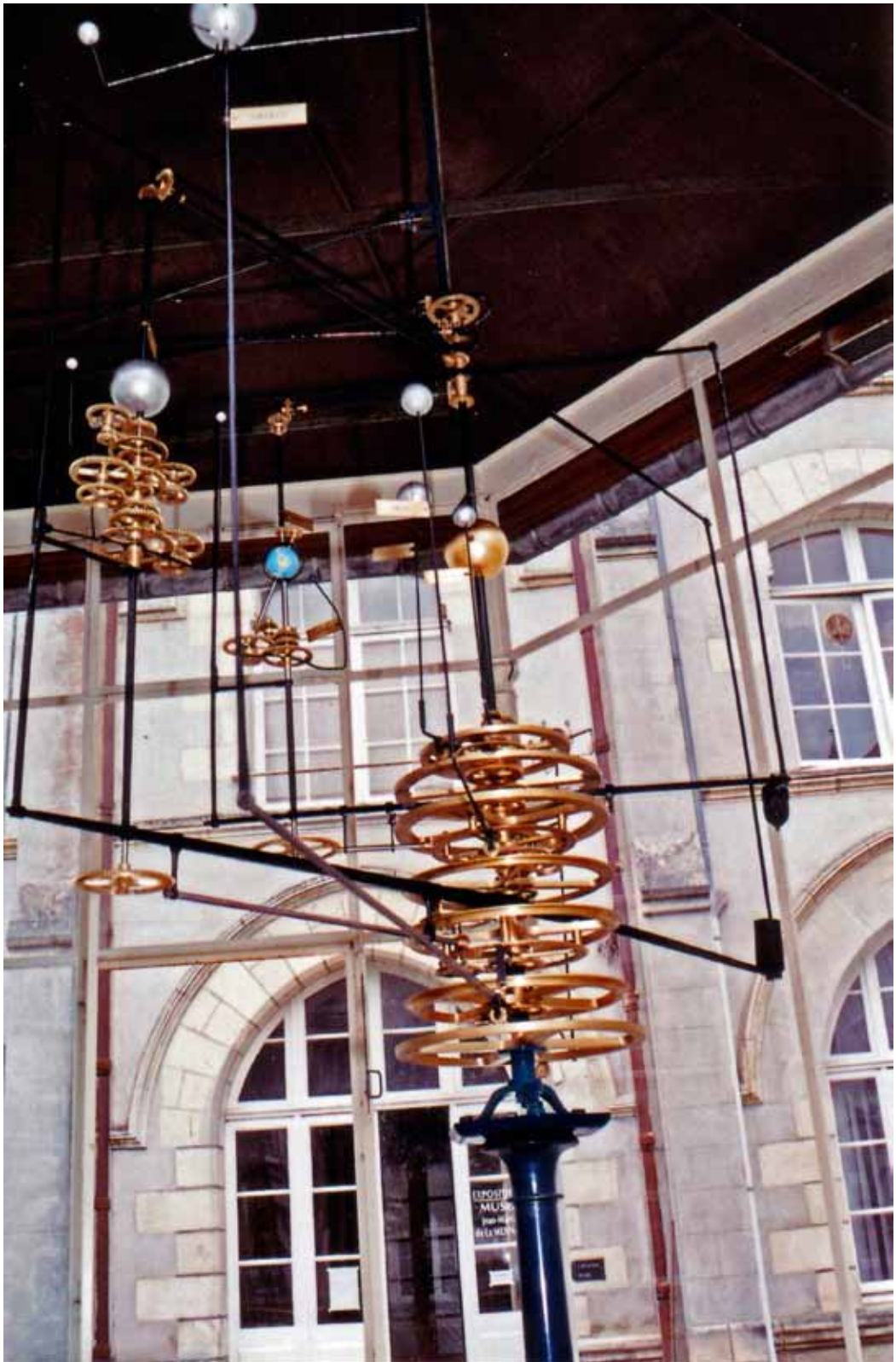
Fig. 15. The planetary system, showing the revolution of the heavenly bodies, stands on a separate pedestal.