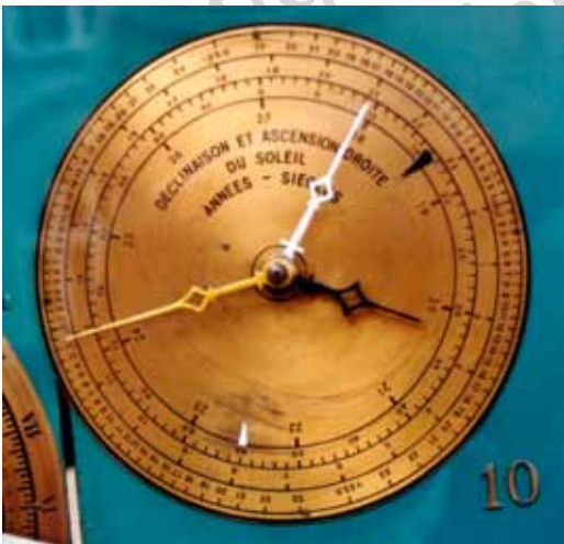
Figs. 10-14: The dials nrs. 6, 7, 8, 9 and 10.

location the place must be found on one of the hemispheres, then by finding the number indicating its meridian, this gives the time for the chosen location.