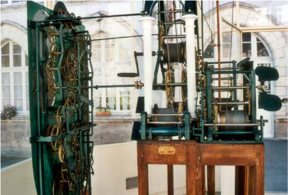
Fig. 4. Side view of the movement, with the rods transmitting the movements to the dials.

The mechanism of the Angelus is made so as to enable it to be rung as many times as required without affecting the regular times in any way.