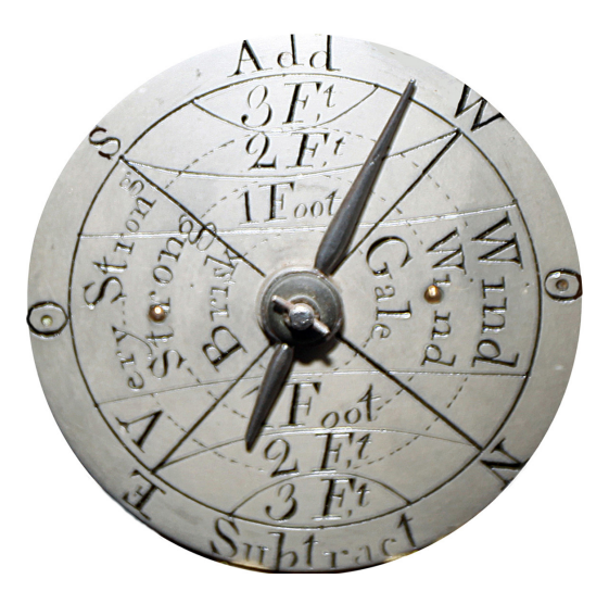
Fig. 4. The wind dial.

Hutchinson used Smeaton's wind intensity scale (Table 4). In reading the scale on the wind subsidiary dial (Fig. 4), it is important to note that during the intervening 250 years since it was created, subtle changes in the definitions of some terms have occurred. Therefore the wind descriptions are not incorrectly placed on the dial as was thought when a description of the clock appeared in AH December 2007, p. 555, where the authors wrote: 'It appears that the engraver mistakenly has put 'Gale' in the 'Brisk Wind' zone and merely 'Wind' in the 'Very Strong' zone'.