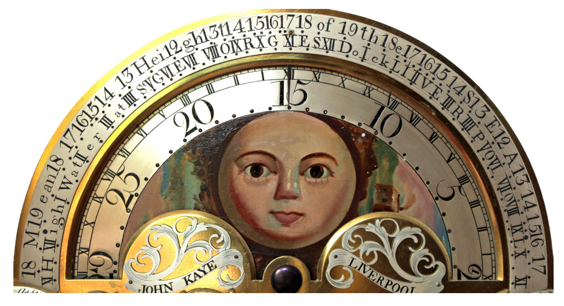
Fig. 1. Engraved detail in the Kaye arch.

way, but there is much more information to be gleaned which is specific to Liverpool. This is the only dial we have seen which shows predicted heights of tides. This was important to ports such as Liverpool which had a large tidal range; the town's enclosed docks meant that there had to be a certain level of water above the dock's sill to allow ships' safe entry or exit. This complicated the logistics of ship movements in and out of docks which had to be organised around a relatively short window of opportunity when there was sufficient water above the sill.